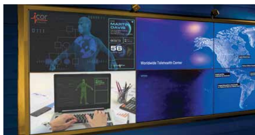
iCorHealth Command Center at Nicklaus Childrens Hospital TeleHealth Center